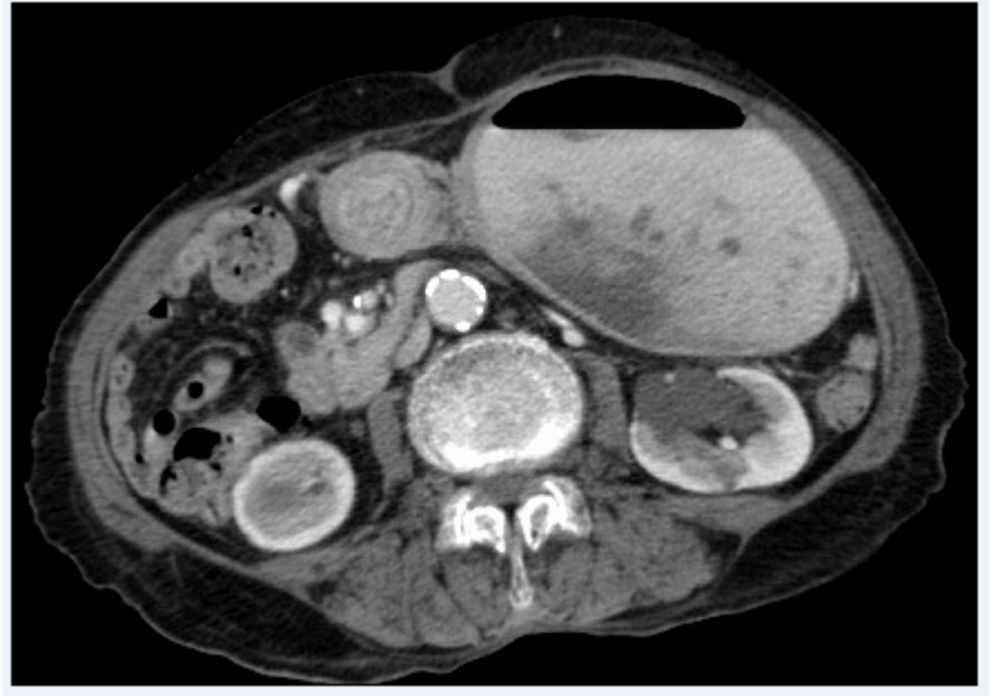
Figure 2. The invagination of the remaining stomach into the duodenum, viewed on axial CT cross-section