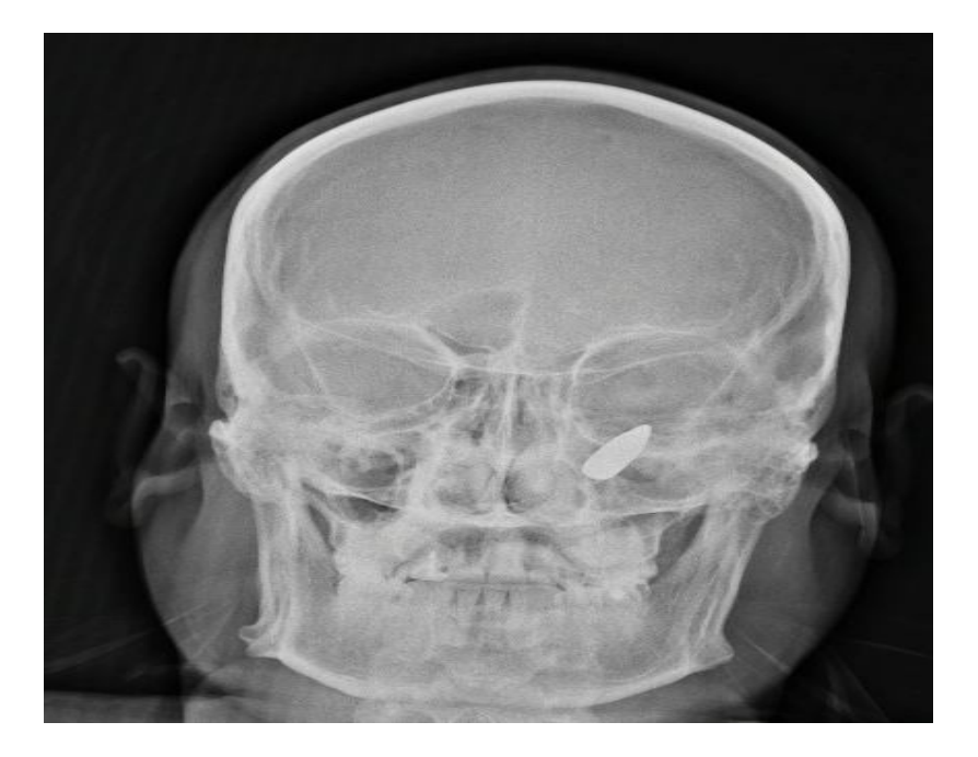
Figure 2: Anteroposterior skull radiography. Note the bullet in the inferonasal side of the orbit.

Figure 1: Lateral skull radiography. Note the bullet in the inferior side of the globe.